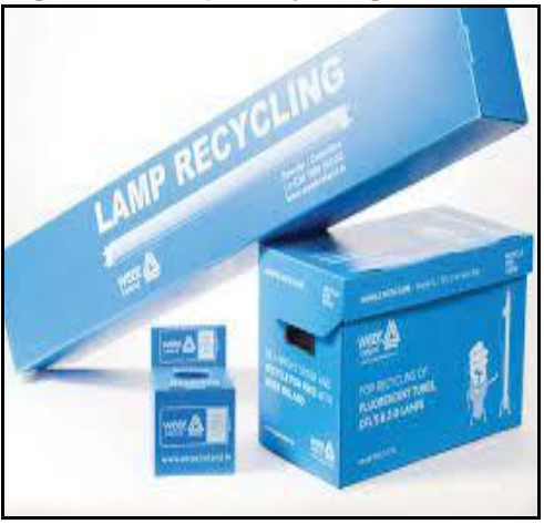
Figure 6 Lamp Recycling Box

Available FREE for small weee collections Portable and mobile unit Can be secured in-doors FREE collection when full Lo-call 1890 253 252. email operations a weeelreland.le or visit www.weeelreland.le